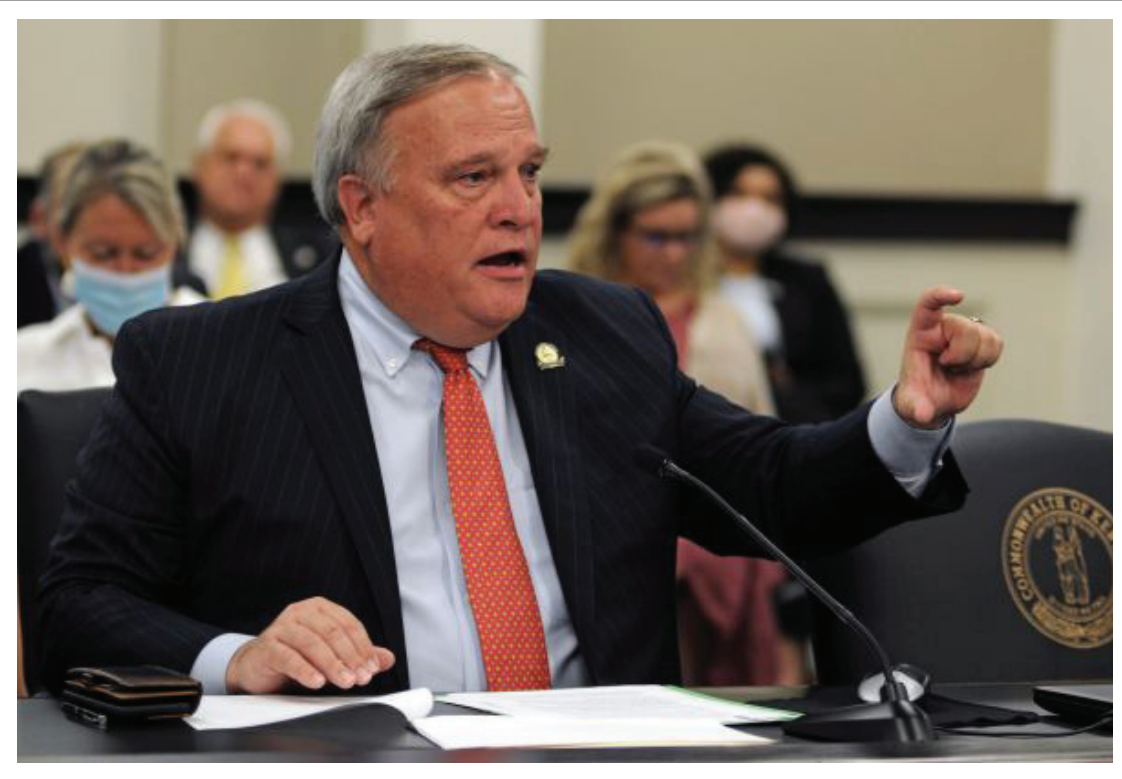
Senate President Robert Stivers, R-Manchester, explains Senate Bill 3 during a legislative committee hearing on Sept. 10.

Education: Senate Bill 1 will prioritize inperson learning at public schools while shifting