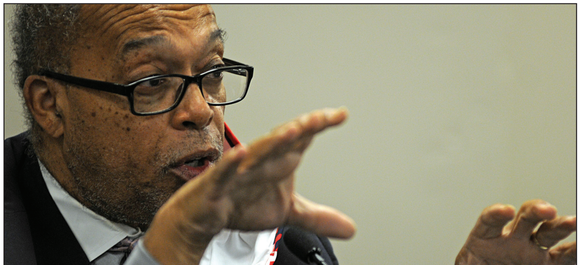
Sen. Reginald Thomas, D-Lexington, asks a question during the Sept. 15 meeting of the Interim Joint Committee on Education.

Those mitigation strategies include requiring students to wear masks, check their temperatures prior to boarding the bus and using hand sanitizer, according to Kinney’s presentation.